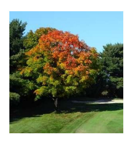
5-6 CENTENNIAL PROMOTIONS